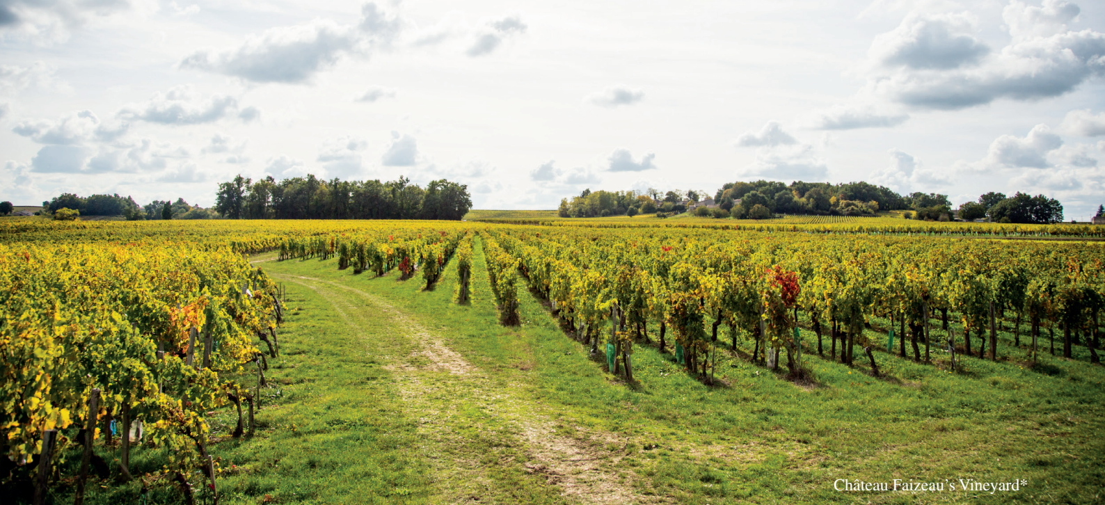
Château Faizeau's Vineyard*

Château Faizeau's vineyard is one of remarkable quality that makes the most of the wonderful terroir and a prime location on an east-west facing plateau bathed in sunlight all day long. A single stretch of twelve hectares extends over a terroir of gravel and clay.