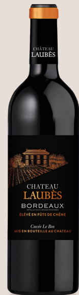
BORDEAUX ÉLEVÉ EN FÛTS DE CHÊNE

Château Laubès offers a range of wines which are typical of the Bordeaux area vineyard and which will delight all palates. The rosé wines, just like the white wines, are delicately balanced between roundness and liveliness.