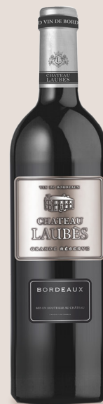
BORDEAUX GRANDE RÉSERVE